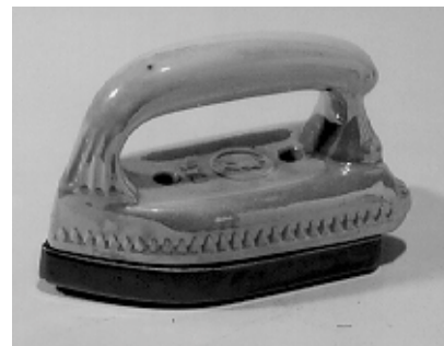
Fig.4 Ceramic Iron (1945)

Irons are the final product category I would like to highlight in this paper. In the past, traditional irons such as the Japanese kote and their Chinese equivalents used heated coals. Their size and form varied depending on the folded portion of the costume that they were designed to iron. Irons are traditionally made of iron and steel but this is not always the case. Around World War Two, metals were scarce and as a result glass irons (U.S.A) and ceramic irons (Japan) were manufactured during this period (Fig 4). Irons manufactured for the Asian market tend to be smaller and lightweight than those in the West. This could be due to the smaller size of Asian users in general, especially its female population who are the primary users of this appliance. The world's smallest iron claimed the Taiwanese, was conceptualized, engineered and manufactured in Taiwan. The size of this iron is 11.5 cm by 6 cm by 6cm and uses a mere 35W of electricity. It is so small that it has no product function interface - no ON/OFF buttons nor heat regulator dial. There are ceramic coils inside the small iron that allows it to self regulate the heat emission such that it can iron both silk and cotton. The small surface of the iron also allows it to maneuver in between the spaces of the buttons and folds.