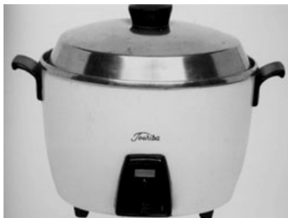
Fig.3 Toshiba Electric Automatic Rice Cooker (1955)