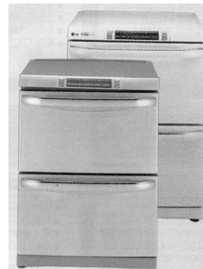
Fig.2 Korean Kimchee refrigerator

The link between consumer needs and design is evident in the Kimchee refrigerator in Korea. (See Fig.2) Kimchee or preserved vegetables served cold with a spicy and sour taste is a staple of the Korean diet. Kimchee is to Koreans what soy sauce is to the Chinese. In the past, in order to keep the kimchee at the optimum temperature during the fermentation process, large pots were buried underground during winter and retrieved as needed. However, as people began moving into apartments without plots of land, this method of storing kimchee became impractical. Refrigerator manufacturers caught onto this and LG Corporation introduced the concept of storing Kimchee in refrigerators in the 1970's. This was followed up with the sale of specialized Kimchee refrigerators in 1985. Today, this type of refrigerator is mass-produced and found only in Korea. It is a fine example of a culture-adapted product.