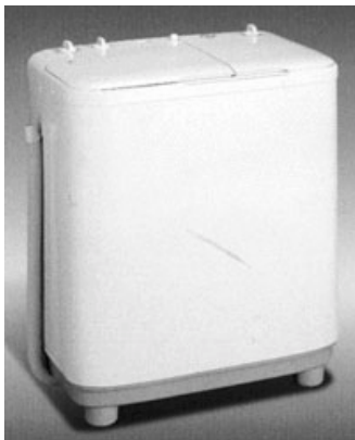
Fig.1 Haier Washing Machine

the same technology and provide farmers with a low cost solution. Haier Corporation's Dual Functional Washing machine is a good example of innovating a product according to the needs of that particular niche farming society. (see Fig.1)