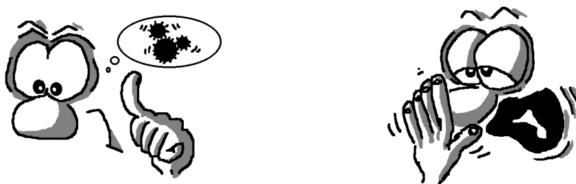
Figure 2: The two emoticons "reasoning" and "yawning".

All--from the user's point of view--important internal states of the game algorithm were presented by the virtual player with six different facial expressions and a corresponding sound (comic strip pictures as in Figure 2: "Reasoning" = a face with a balloon of turning wheels and a machine-like sound, "Waiting for the next move" = a yawning face with a corresponding sound, "Initial state" = a face with blinking eyes, "Incorrect move" = an angry facial expression with an indignant cry, "Be the winner" = a happy facial expression with an arrogant laughter, "Be the loser" = a shrinking face with a disappointed cry). We call these six comic strip pictures "emoticons" (acronym for "emotional icons"). All emoticons of the virtual player are shown on a second color screen (17 inch). If a user wanted to cancel or restart a game, then he or she had to press the real NEW button at the right corner in the front of the station.