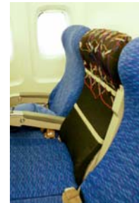
Fig. 2. FSR sensors on head rest area

An experiment was conducted to measure and validate the seat sensor networks. The experiment was implemented in the aircraft cabin simulator. The experiment was conducted for each individual separately. The position and physiological condition of test subject was measured with Max and microcontroller. Force sensing resistor (FSR) was used for passenger sitting comfort monitoring. Fig. 2 shows the attachment of sensor systems at upper seat area.