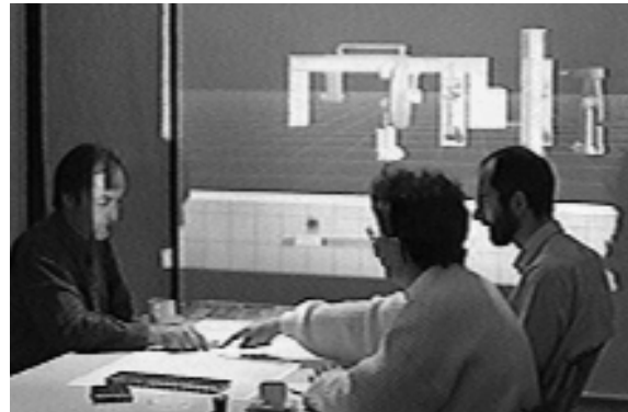
Fig. 1: The design room of BUILD-IT

power for digitising the video signal coming from the camera, analysing the users' interactions on the table, and rendering the interaction result in the two views.