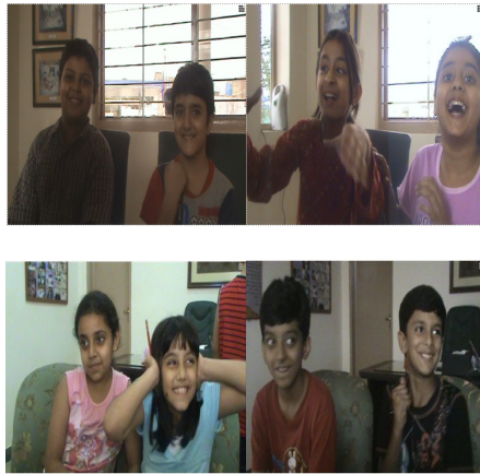
Figure 2. Children involved in the game.