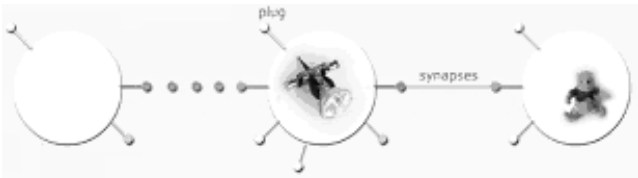
Figure 1: A visualisation of the basic vocabulary terms: eGadget, Plug, Synapse, GadgetWorld

supports the encapsulation of the internal structure of an eGadget (eGadgets are treated as “black boxes”, based on their public interface as manifested by the Plugs), and provides the means for composition of an application, without having to access any code that implements the interface [2]. Thus, this approach provides a clear separation between computational and compositional aspects of an application [4], leaving the second task to end-users. The benefit of this approach is that, to a large extent, system design is provided ready to the end user, because the domain and system concepts are specified in the generic architecture.