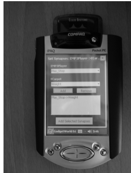
Figure 3. The GadgetWorld Editor running on an iPAQ.

A central research question for the eGadgets project is whether the end-user will be inclined and able to use GAS