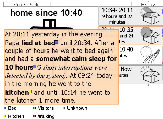
Figure 4. Screen shot of subject's A1 Daily-Activity-Diarist, showing all three levels of detail presented to users.