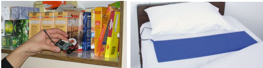
Figure 7. Placing a wireless mote with a photo sensor in a cupboard(left), an illustration of a pressure pad used for bed-activity detection (right).

On the ADL-state-extraction side, a collection of these motes is abstracted in software, and the collected data are transformed to kitchen activity data. A sequence of 'open cupboards' is interpreted as high kitchen activity with the corresponding duration and intensity.