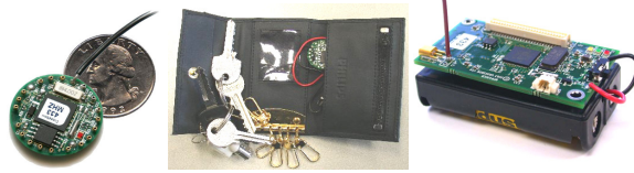
Figure 6. From left to right: mica2dot mote, key fold with mica2dot, and mica2 mote.