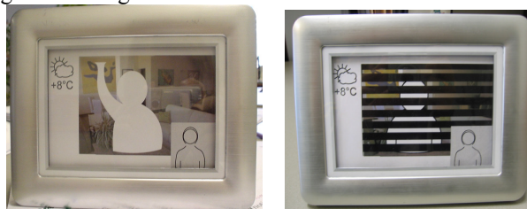
Figure 1. Two of the prompts used in the focus group sessions

Both groups were quite positive about prospective system-attributes such as its unobtrusiveness. Interestingly the main concerns about privacy arose at the social-intimate side, who did not wish to compromise the privacy of their elderly relative, while a typical response given by elderly was " Anyhow, we know everything about each other ". Social-intimates expressed an interest in being aware of the physical-status on the other side (e.g., sleeping, eating etc.), critical events such as rapid decline of the parent's health. They were also interested in knowing the feelings and moods of their parents; however seniors were reluctant regarding the communication of negative feelings.