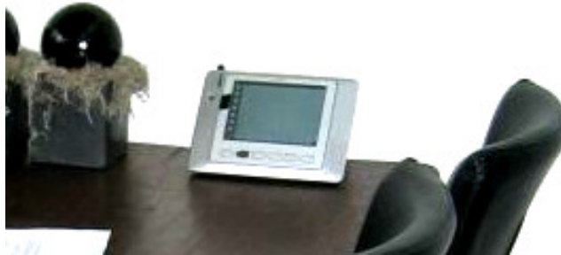
Figure 9. Presentation Client (iPronto) at participant's B2/B3 living room

In the end of the first week batteries were changed as scheduled, and then the system was left to run for seven more days. Interviews with each participant were conducted at the end of the second week. We also used standardized questionnaires to measure social connectedness using the ABC questionnaire [21] and well being through the subjective complaints questionnaire [20]. Given the small sample size these were not intended for quantitative analysis, but to prepare larger scale trial and to see if any interesting variations in connectedness/well being could be indicated by our participants.